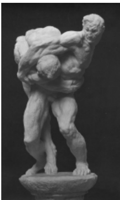
Berthold Nebel FS'17 (untitled)

ALEKSANDER BURSCHE MEC'00 abursche@yahoo.com