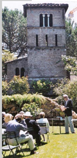
Mark Strand reads his poem "The Garden" at the Villa Aurelia on a beautiful June day.