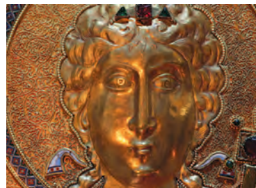
Bissera V. Pentcheva: Icon of the Arch- angel Michael, late tenth century (detail of the head illuminated by candle).