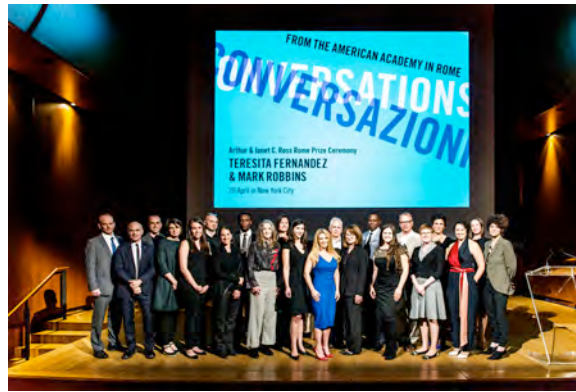
20 of the 2017 Rome Prize Winners in NYC